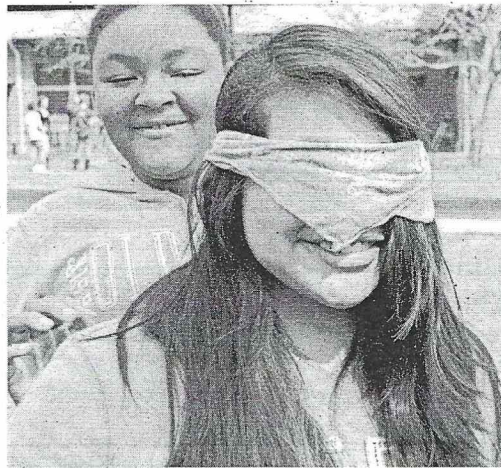
At Science in Action Day in 2014, students are blindfolded and asked to use their sense of hearing to detect where other blindfolded students are.