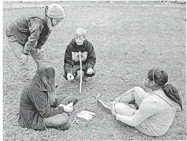
Using physics and teamwork, students last year at Science in Action Day tape straws together to keep an egg from breaking.