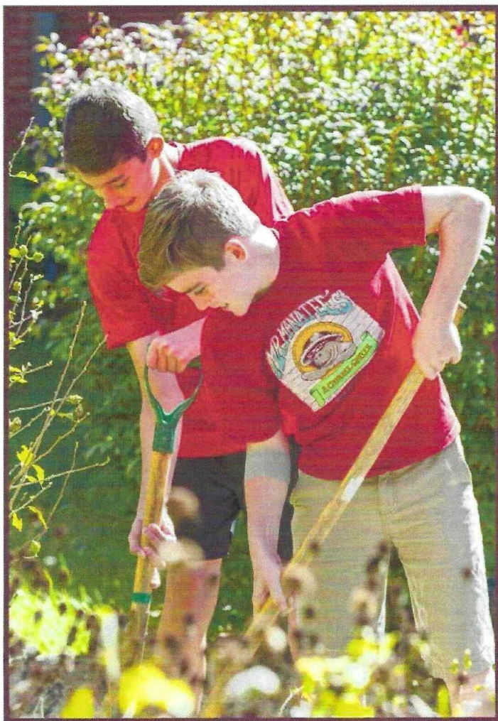
Owen Middle School students take part in planting and maintaining native vegetation around campus.

the outdoor work and improvements that are accomplished through our Natural Impact Initiative and partnerships. Our wonderful 40-acre campus gives students the chance to live out our school beliefs — being stewards of our environment and student-led, inquiry-based.”