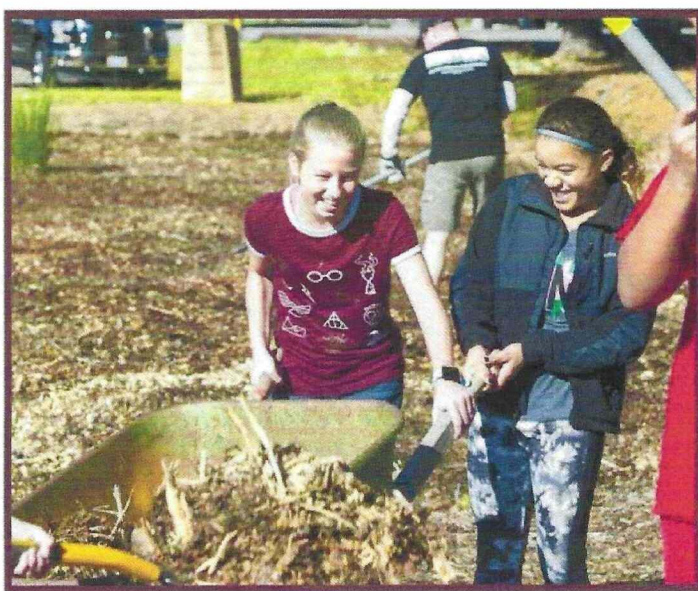
Students spread mulch for a ropes course at the school in October 2017.